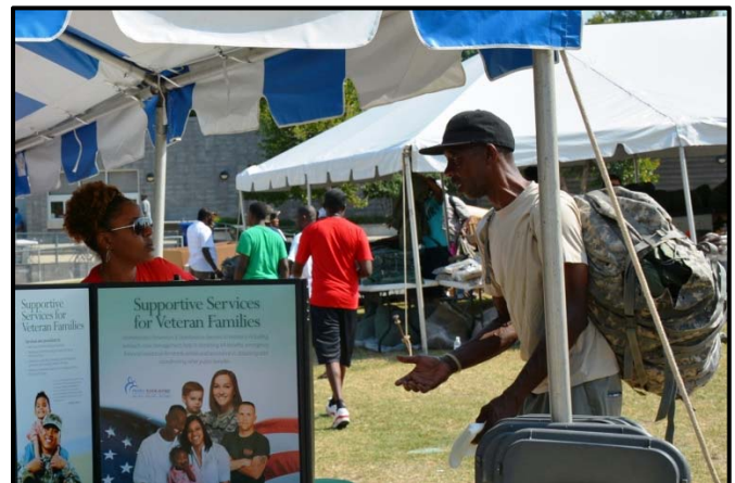
For the second year in a row, All-American ROCKS Chapter members lend their support to annual Community Homeless Stand Down in Fayetteville, N.C. More than 700 people, including about 350 Veterans, attended this year’s event.

“We love the rewarding experience of our touch time with the surrounding community (particularly the Veterans) and the ability to provide an encouraging word or swap stories on our military journeys,” the All-American Team expressed.