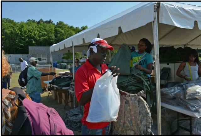
All-American ROCKS Chapter of Fort Bragg dispenses clothes and supplies to hundreds attending the Community Homeless Stand Down in Fayetteville NC.