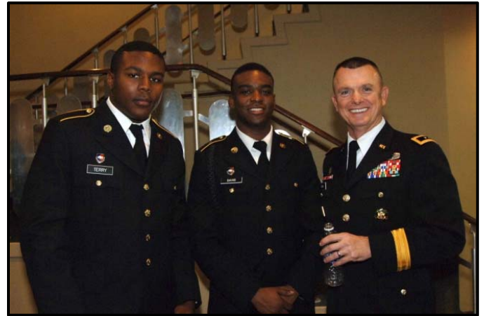
Howard University Army ROTC Cadets speak with General Officers during a one-on-one discussion at the icebreaker session.

way to help build connections for the future. Howard University’s ROTC program continues to make great strides towards excellence and I believe that this forum demonstrated that. The amount of planning and execution it took from our Cadre and Cadets speaks great volumes to what our program is doing not only for our Cadets, but also for Cadets across the nation. Events like these are what will stick with me and motivate me through my career as an officer to be as successful as I can be so that I can impact a young man or woman’s life just as I was impacted.