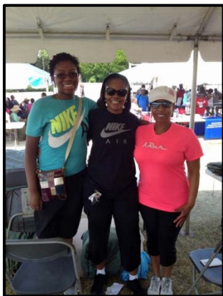
All-American ROCKS Chapter members pose for a photo before the start of the Community Homeless Stand Down in Fayetteville NC.