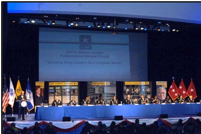
Eleven General Officers serve as panel members, and are engaged in questions and discussions at the Senior Leader Mentorship Forum.